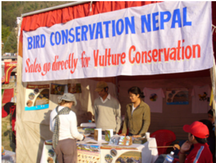
Bird Conservation Nepal selling books for vulture conservation