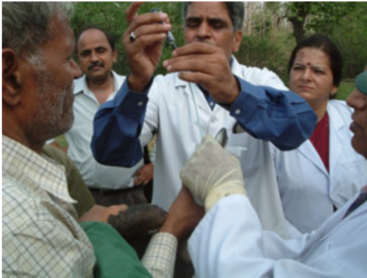
IVRI staff safety testing meloxicam at the India Centre