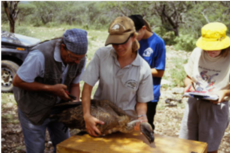
Safety testing meloxicam on African white-backed vultures