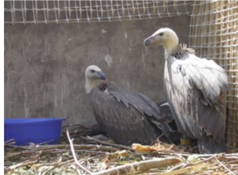
Two captured long-billed chicks at the Pinjore Centre