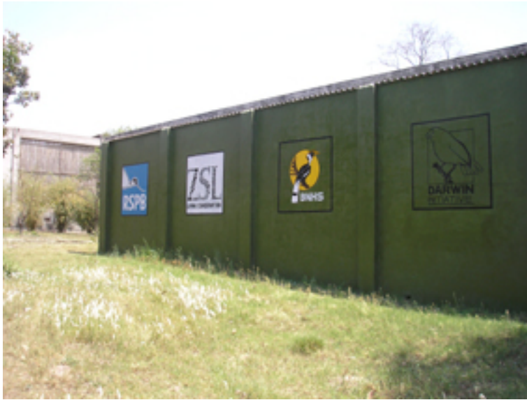
One of the original aviaries at the breeding centre