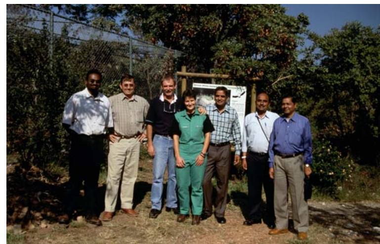
Indian staff visit South Africa to collaborate on safety testing