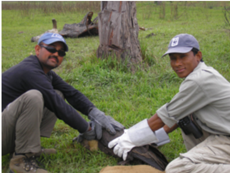
BCN staff hold a captured vulture fitted with a satellite tag