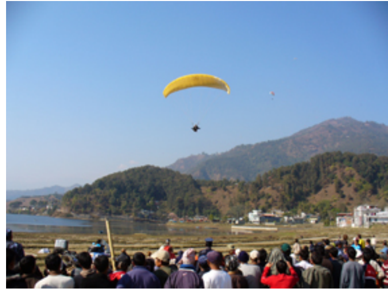
A competitor lands in front of the crowd at the paragliding event