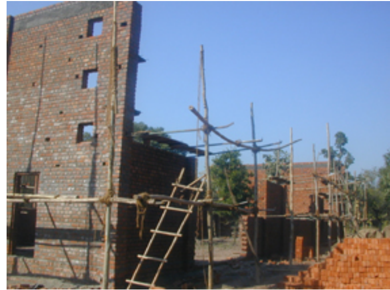
Construction of a new colony aviary at the Pinjore Centre