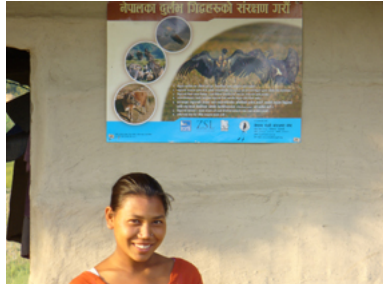
A local Nepali woman in front of a vulture conservation poster