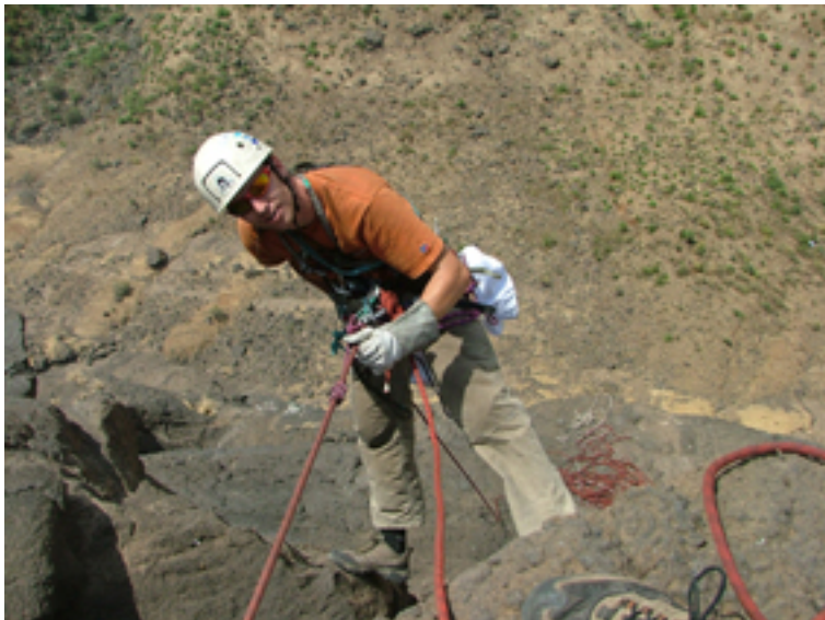
A climber capturing long-billed vulture chicks from cliffs in India