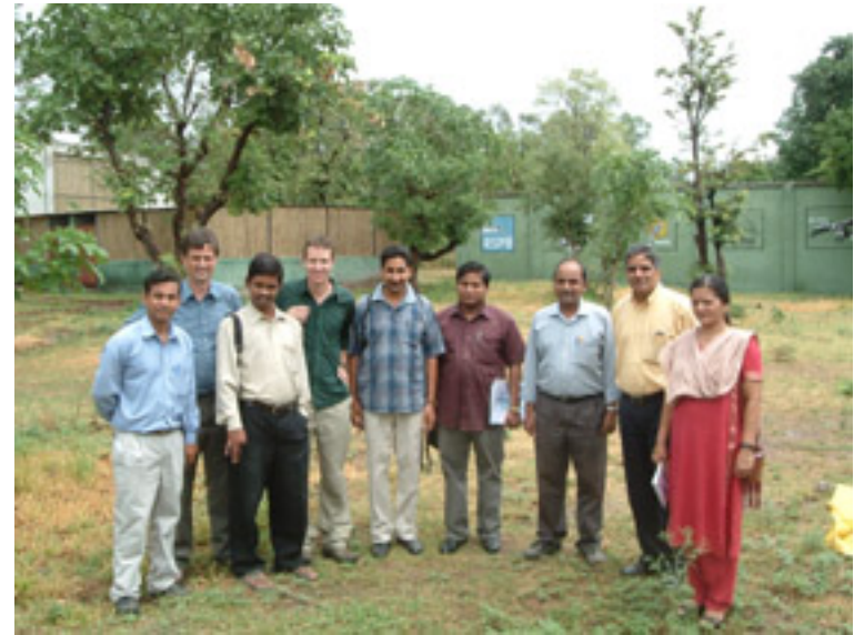
Indian and UK project staff involved with safety testing